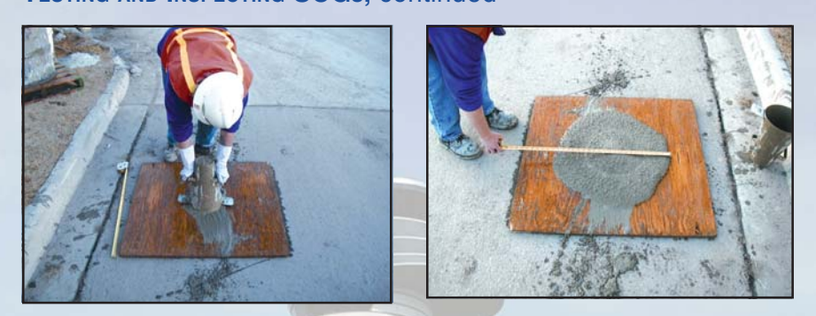
The slump flow test is done on a flat surface using a standard slump cone. After filling, the cone is lifted and the diameter of the resulting pat is measured.

from grouted standard size concrete masonry units (8x8x16 in. nominal dimensions) and cores will meet the required height-to-diameter aspect ratio.