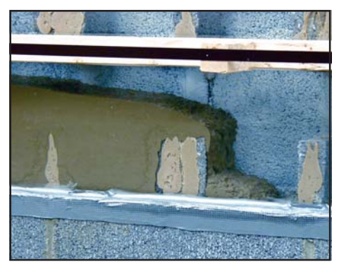
This close-up of the panel in the previous photo shows the leading front of the grout as it travels over a projection into the core, flowing around obstructions to fill the cells completely.