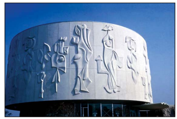
Self-consolidating concrete is able to flow into almost any shape or form, providing excellent surface characteristics. For the Porthaven Professional Building in Coyahoga, OH, white concrete was used to present the design of sculptor Harvey Wheeler.

Among the most significant innovations is self-consolidating concrete (SCC). The construction industry has always longed for a concrete that can flow easily into tight and constricted spaces without requiring vibration. Over the years the need for this technology has grown as designers specify more heavily reinforced concrete members and ever more complex formwork.