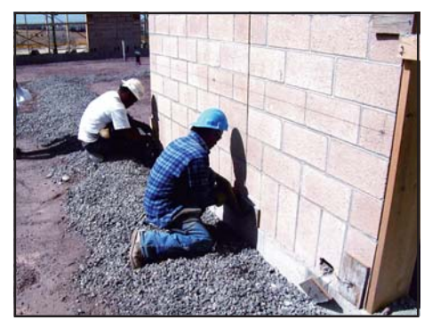
Cleanouts are used to assure that grout spaces are clean and free of debris prior to grouting.

speeding up the construction project and further decreasing the cost of putting the grout in place.