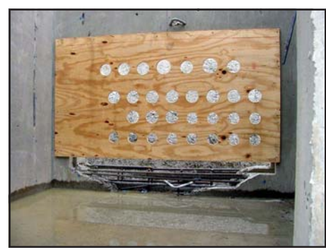
Poor flowability and rebar congestion led to exposed steel bars in the lower end of this manhole wall. SCC could have flowed easily to the bottom of the forms to prevent this situation.