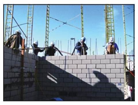
Reinforced masonry with fully grouted cells creates solid confinement for prisoners.