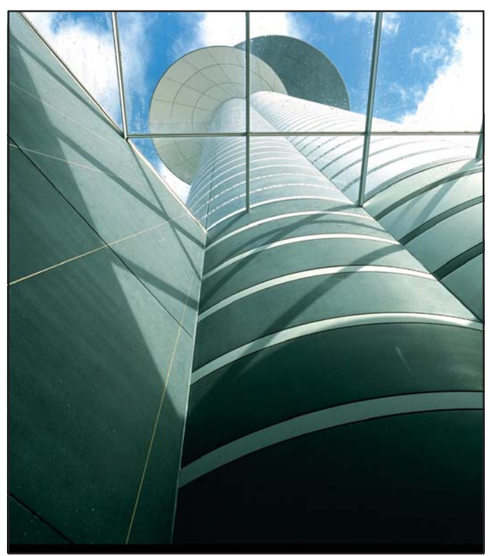
Slim and accurate constructions are much easier to realize with SCC, such as this 83-meter high Stockholm Airport tower, which is decorated with excerpts from the work of Antoine de Saint Exupéry. Reduced noise levels made construction during nighttime hours possible.

Are concrete and masonry structures getting more complex? Definitely, they are. Architects and engineers are creating ever more unique shapes and building accents with this fabulous and moldable material. With SCC and SCG increasing in popularity we are seeing more exposed concrete with curved faces, intricate designs and thin elements. SCC and SCG is not a niche market for precast producers and savvv masonry contractors, it is a mainstream building material. The strong economy, steady residential construction and strong growth in non-residential construction coupled with labor shortages make SCC and SCG ideal candidates to speed up your construction and make the best use of limited project budgets and resources.