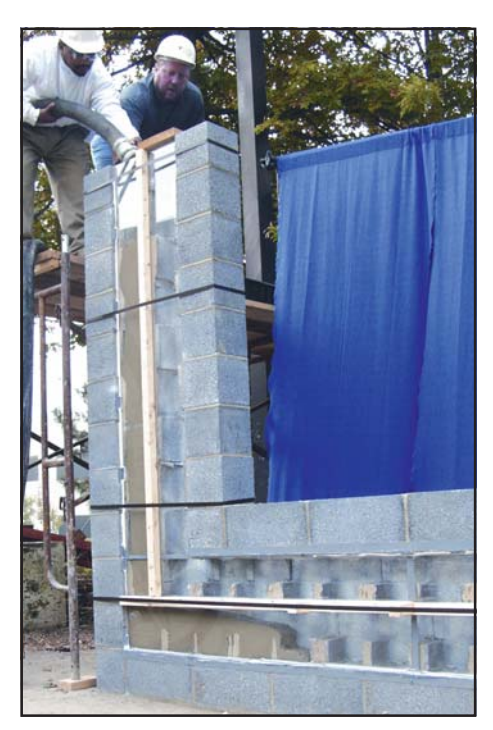
As seen through the clear plastic face on this demonstration panel, self-consolidating grout moves freely in tight spaces.

The contractor saves in two ways. If walls contain reinforcement, it's cheaper to use a little more grout and grout everything than to pick out certain cells and increase labor costs. Also, there's no need for an extra laborer on top of the wall to run the vibrator. That person can be assigned to other duties on the job,