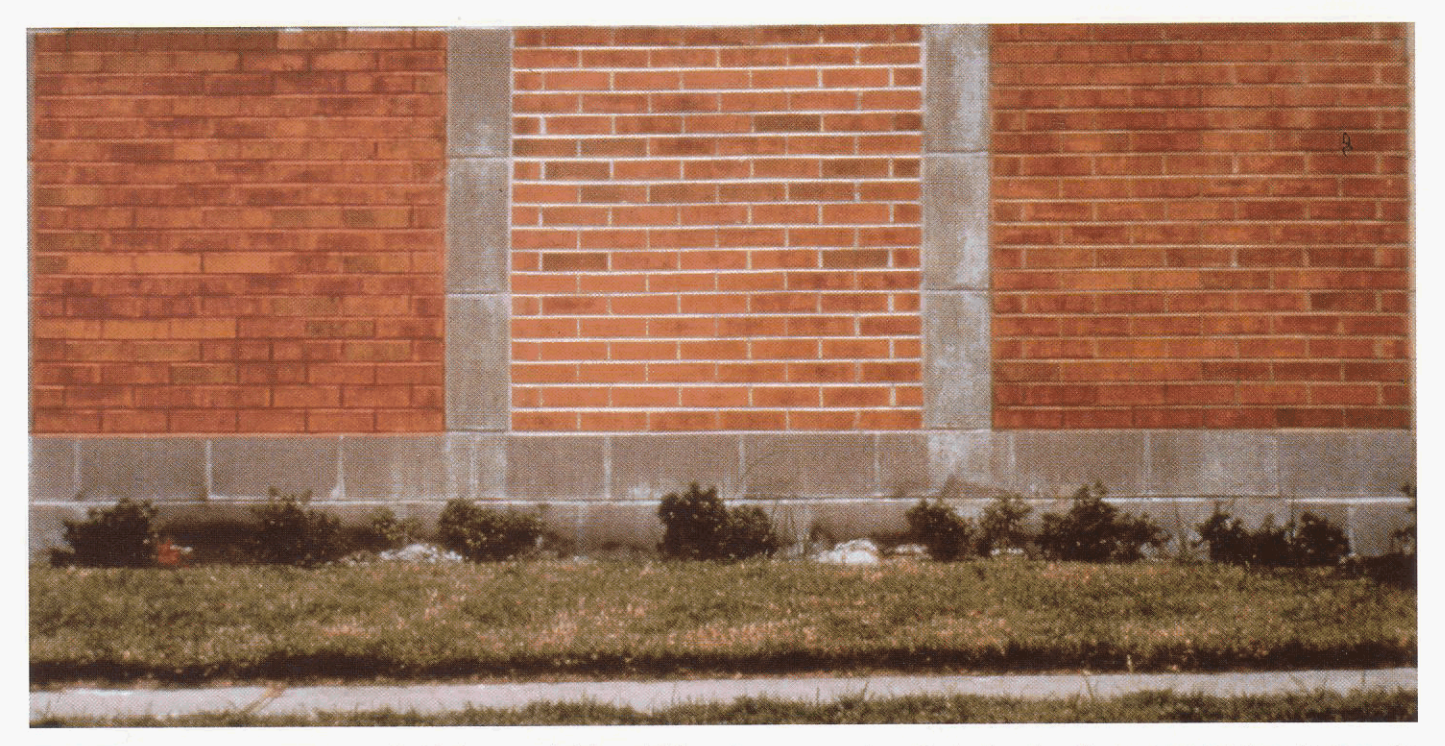
Fig. 2. These panels are constructed with the same brick and different colored mortars illustrating the effect mortar color can have on the overall appearance of masonry.