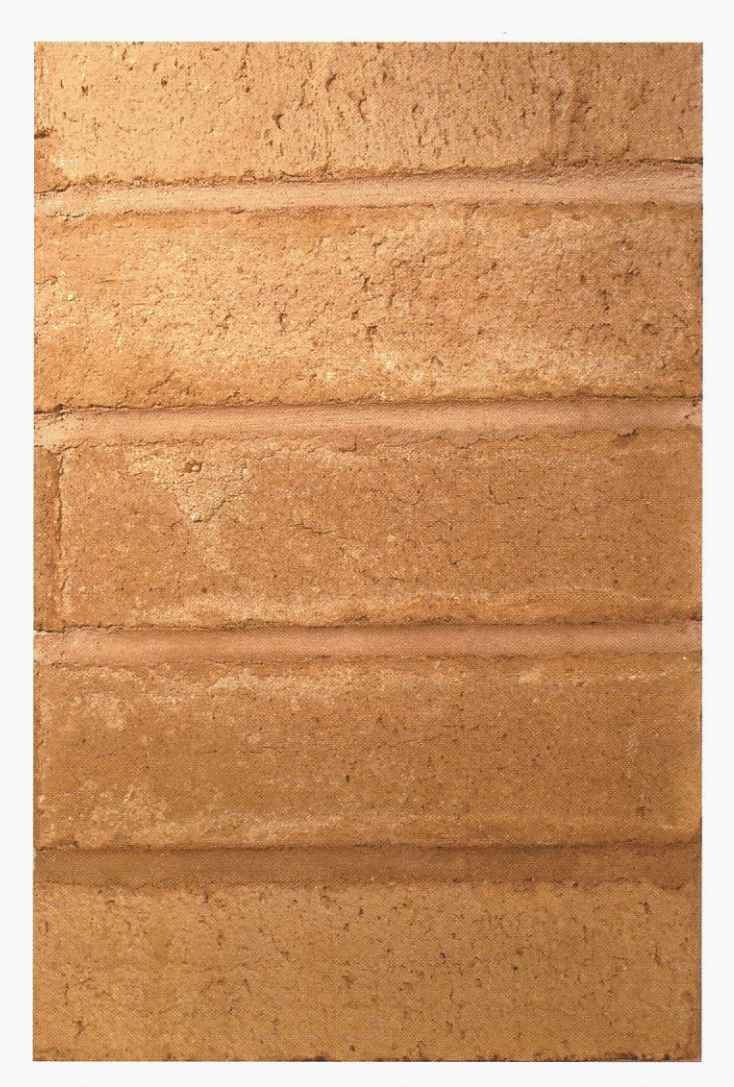
Fig. 3. In this example, a masonry prism was constructed using one batch of mortar. The top mortar joint was tooled immediately after placement of the unit. Remaining mortar joints were tooled at progressively greater time intervals and thus stiffer consistency. The relationship between mortar consistency when tooled and mortar color is quite apparent.

Unit Suction, Tooling, and Curing. When freshly mixed mortar is placed between absorptive masonry units, much of the water contained in the mortar is absorbed by the units. Thus the actual ratio of water to cement in a mortar joint when the mortar sets may be substantially lower than what the ratio was when the mortar was initially mixed. How