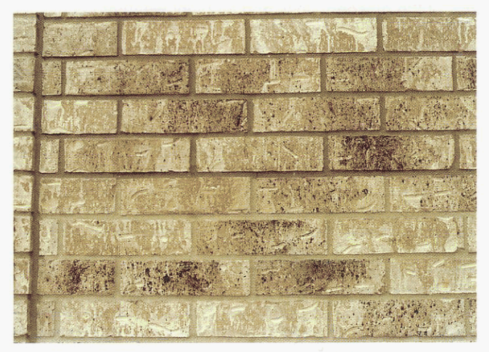
Fig. 5. The difference in mortar color in this example was determined to be the result of a change in both sand and type of cement used in the mortar.

Use the Same Mortar Materials. Changes in brands of masonry cement, mortar cement, portland cement, hydrated lime, or pigments during construction of a project should be avoided. All of the sand should be from the same source. When multiple sand shipments are required, the mason contractor should visually check the appearance of successive shipments to assure that sand color and gradation has not changed significantly. For jobs having particularly demanding requirements on mortar color, it may be advisable to keep a small quantity of sand from the first shipment in a sealed container for comparison with subsequent shipments.