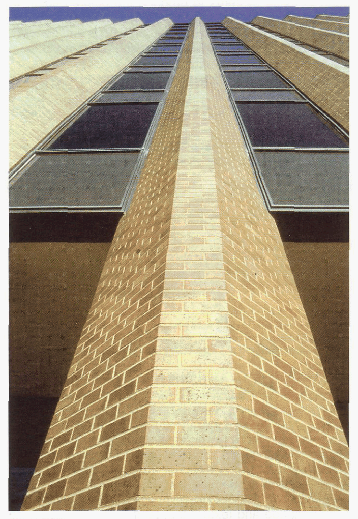
Fig. 6. With care and cooperation, consistent mortar color producing the appearance desired by the owner can be achieved.

Clean Masonry Carefully. Use the least aggressive cleaning technique possible. Make certain that the cleaning procedure is consistent with the recommendations of the manufacturer of the units, and pre-gualify the procedure on the sample panel and a small test area of the building. When acid based cleaning solutions are used, the mortar should be allowed to cure at moderate temperatures for about seven days prior to cleaning. After cleaning a trial area, allow the area to dry, and closely examine mortar joint surfaces to ascertain that the procedure has not etched the surface. A more detailed discussion about this topic is contained in PCA's Trowel Tips: Cleaning Masonry, IS244. View with Pride. It was noted at the beginning of this document that an appreciation for the inherent beauty of masonry is often the reason it is selected by the owner as a building component. Hopefully, that appreciation of masonry is shared by the mason contractor and his crew and will motivate each person to do his part to assure that the finished project is one in which all can take pride.