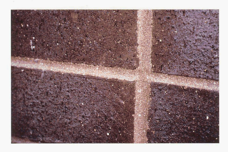
Fig. 4. The use of a strong acid cleaning solution has etched the surface of these mortar joints, exposed sand particles, and significantly changed the appearance of the mortar joint.

Cleaning. Cleaning procedures often completely alter the appearance of a mortar joint, changing both texture and color. Most cleaning techniques are designed to remove mortar droppings or smears from the surface of newly constructed masonry. However, if these techniques dissolve the cement paste from the surface of a mortar joint, the appearance of that joint is no longer dominated by the color of the hardened cement paste, but reflects the appearance of sand particles that are exposed on the surface. The effect of improper cleaning is most dramatic on colored mortar joints, since the pigmented cement paste is relied upon in these systems to produce the desired color. In addition to altering the appearance of mortar joints, improper cleaning may damage masonry units and compromise the ability of the masonry to resist water penetration.