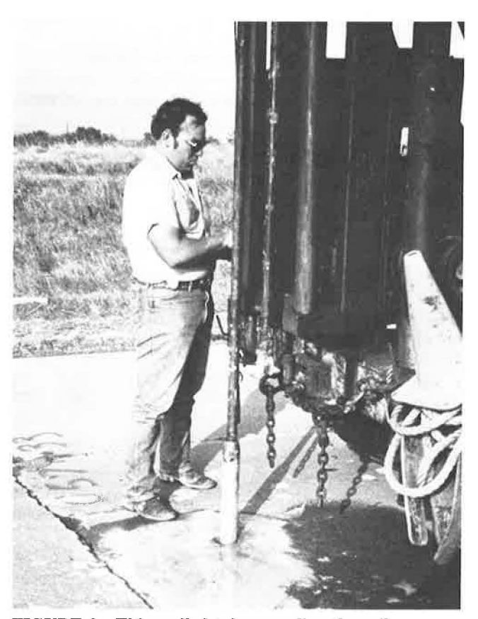
FIGURE 2 Thin-walled tube sampling the soil.

The 1983 investigation included field sampling and laboratory testing from each of the 11 different cement-content sec-