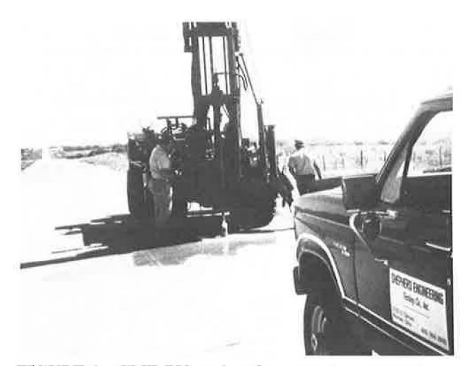
FIGURE 1 CME 750 coring the concrete pavement.

Results of tests during construction and the final characteristics of the modified soils indicate that the revised grading or